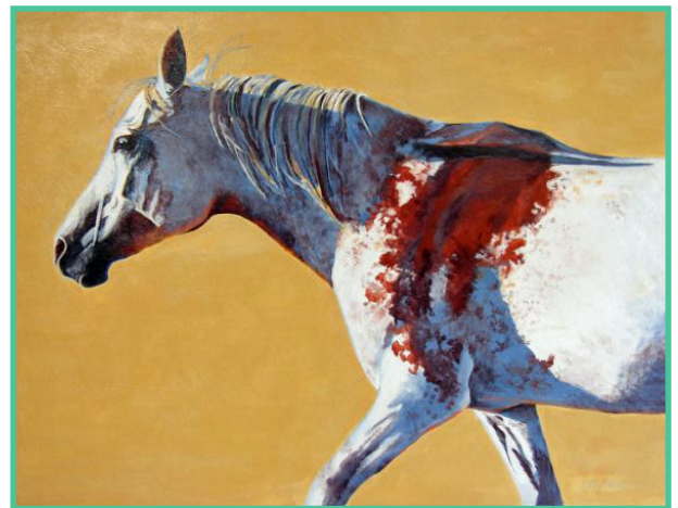
Horse